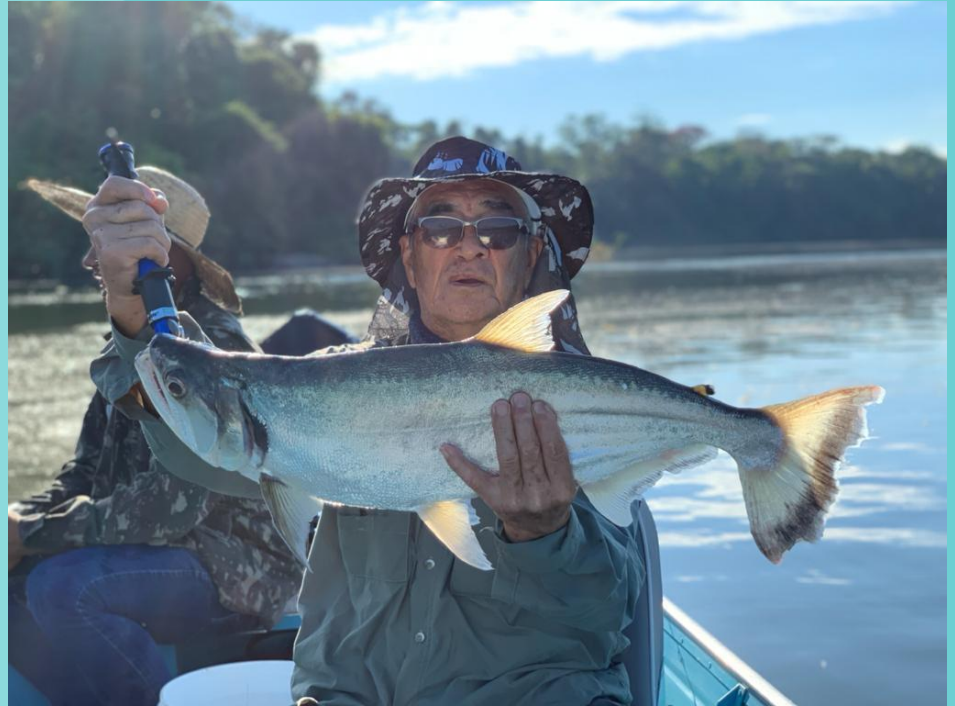
Pirandira – Peixe Cachorro