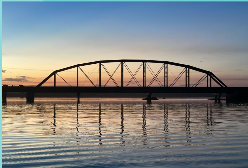
PONTE JACI PARANA