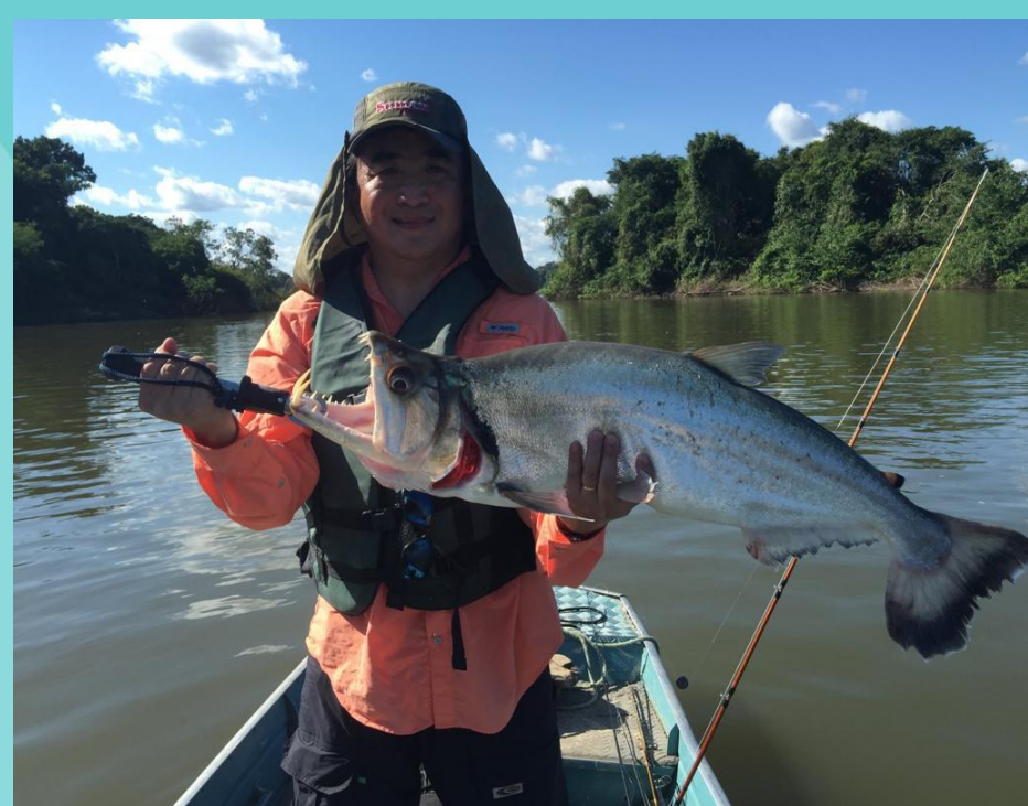
PEIXE CACHORRO - PIRANDIRA